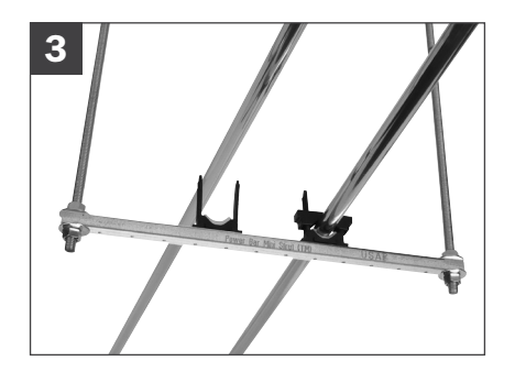
Position tube or conduit into base of TouchDown ^{\text{TM}} clamp.