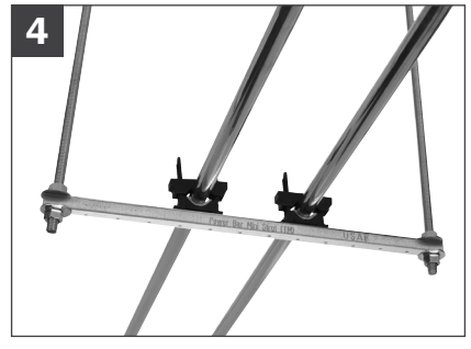
Ratchet bridge of TouchDown™ clamp down over both posts evenly.

▲ WARNING: Cancer and Reproductive Harm www.P65Warnings.ca.gov