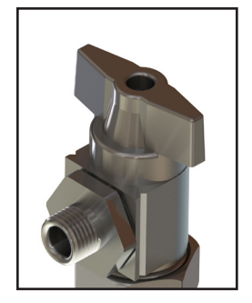
1/4" Compression Outlet