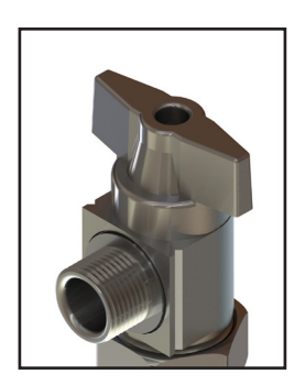
3/8" Compression Outlet