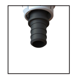
ASTM F2159 Crimp™