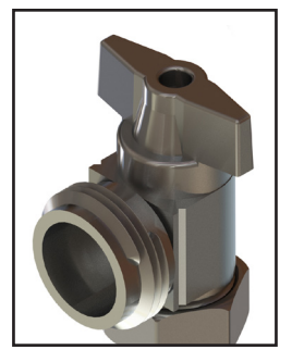
3/4" Male Hose Outlet

Compression-thread outlets connect easily to supply lines.