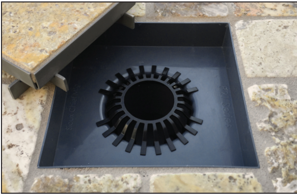
Removable hair strainer included with ABS head models