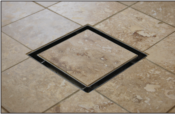
Installs like a standard drain head, but provides the look of a seamless tile floor.