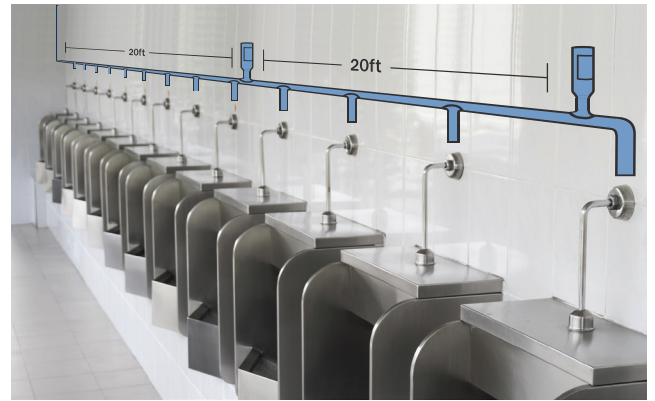
Figure 2 If more than 20ft, place arrester at the end of each 20-foot section, within 6ft of the end of that section..