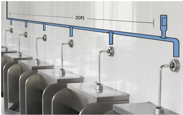
Figure 1 If 20ft or less, place one arrester 6ft or less from the end of the run.

Always install the properly sized arrester at or near the END of hat particular header. The “end” of the header can be defined as “between the last two fixtures,” or “within 6 feet of the last fixture.” In cases of headers longer than 20 feet, place the properly sized arrester for each 20 foot section at the end of that 20 foot section. For example, a 40 foot cold line header will be sized as two individual headers, and have an arrester placed at the END of the FIRST 20 foot section, and also at the END of the SECOND 20 foot section (See Figure 2).